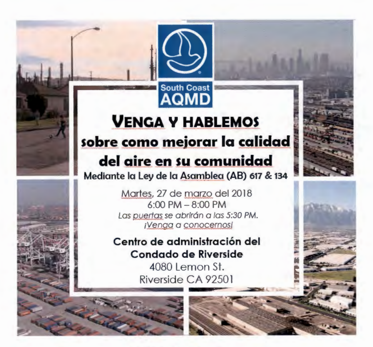
A6: AB 617 Social media post sample