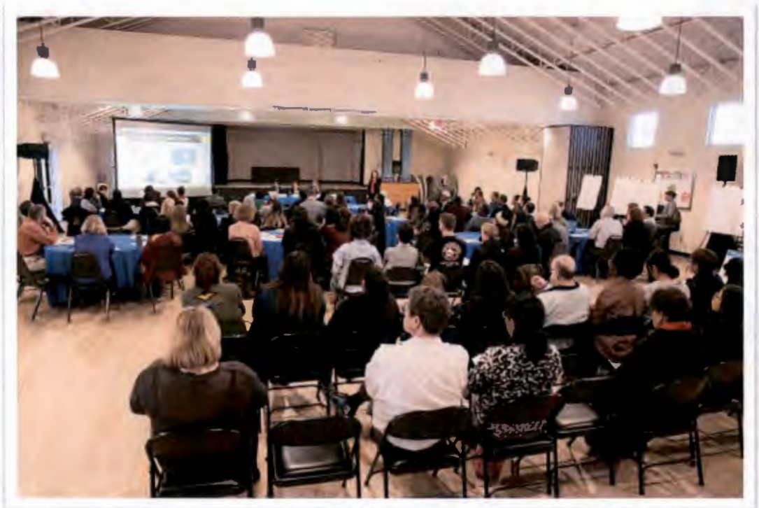
A7: Photographs from AB 617 community meetings hosted by SCAQMD