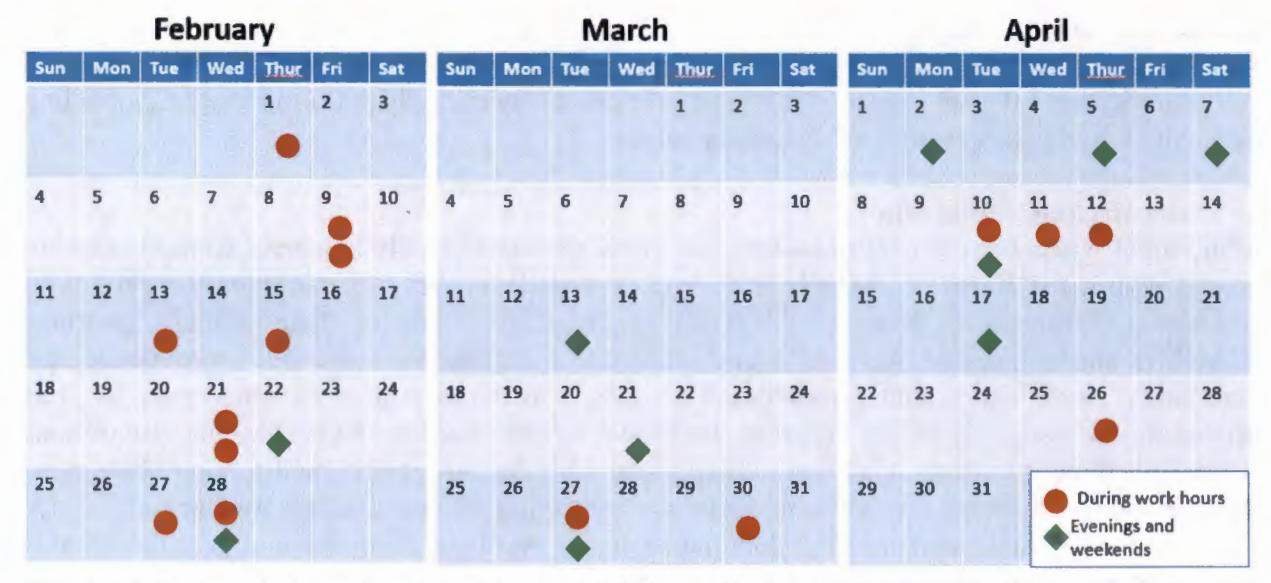
Fig. 1 – Meetings held and attended by SCAQMD staff where AB 617 was discussed (February – April 2018)

A dedicated website was created to provide information on AB 617 events and updates (<a href="www.aqmd.gov/AB617">www.aqmd.gov/AB617</a>). This website included a PDF form, which could be filled in online, and a web form for community members to submit their input and self-recommendations. As of April 20, 2018, SCAQMD staff has received a total of 55 community self-recommendations and will consider all submissions through May 7, 2018 for inclusion in the Year 1 prioritization effort.