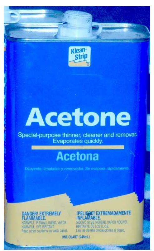
Figure 2 Front Label of Pure Acetone

The Uniform Fire Code (UFC) treats solvents such as acetone, butyl acetate, and MEK as Class I Flammable Liquids. Further, the UFC considers all of these solvents to present the same relative degree of fire hazard. However, because acetone has a much lower flash point than the other Class I Flammable Liquids, acetone is considered to have a more severe fire hazard potential and, as shown in Figure 2, is labeled "extremely flammable." SCAQMD staff conducted a store shelf survey of big box retailers, as well as automotive and cosmetic supply shops, and found a wide array of consumer products that contain very high levels of acetone, with up to 80 percent for some. These include automotive parts cleaners, engine degreasers, nail polish removers, adhesives, paints, and carpet spot removers, mostly packaged in aerosol containers. The labeling notifies consumers that these products contain acetone, an extremely flammable solvent. Because the use of acetone and acetone-based products span multiple applications and have been used for many years without evidence of significant fire accidents<sup>9</sup>, SCAQMD believes that