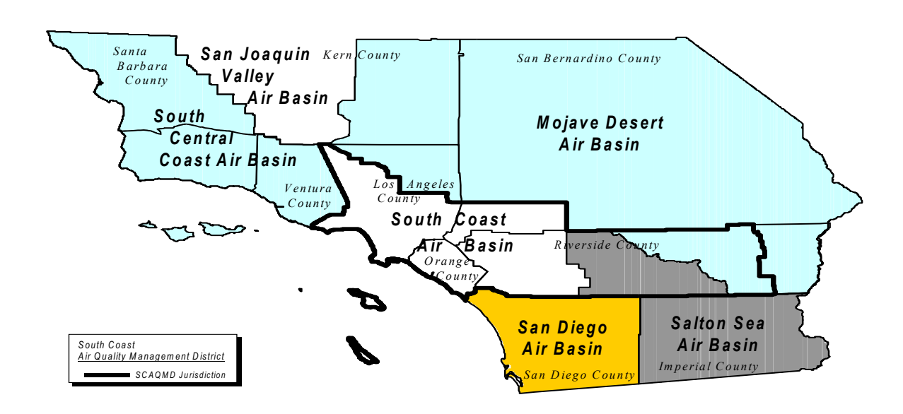
Figure 1 Boundaries of the South Coast Air Quality Management District

Proposed Amended Rule (PAR) 1143 would apply to manufacturers, distributors and sellers of consumer paint thinners and multi-purpose solvents located throughout the SCAQMD's jurisdiction. The SCAQMD has jurisdiction over an area of 10,473 square miles, consisting of the four-county South Coast Air Basin (Basin) and the Riverside County portions of the Salton Sea Air Basin (SSAB) and the Mojave Desert Air Basin (MDAB) as shown in Figure 1. The Basin, which is a subarea of the district, is bounded by the Pacific Ocean to the west and the San Gabriel, San Bernardino, and San Jacinto Mountains to the north and east. The 6,745 square-mile Basin includes all of Orange County and the non-desert portions of Los Angeles, Riverside, and San Bernardino counties. The Riverside County portion of the SSAB and MDAB is bounded by the San Jacinto Mountains in the west and spans eastward up to the Palo Verde Valley. The federal non-attainment area (known as the Coachella Valley Planning Area) is a subregion of both Riverside County and the SSAB and is bounded by the San Jacinto Mountains to the west and the eastern boundary of the Coachella Valley to the east.