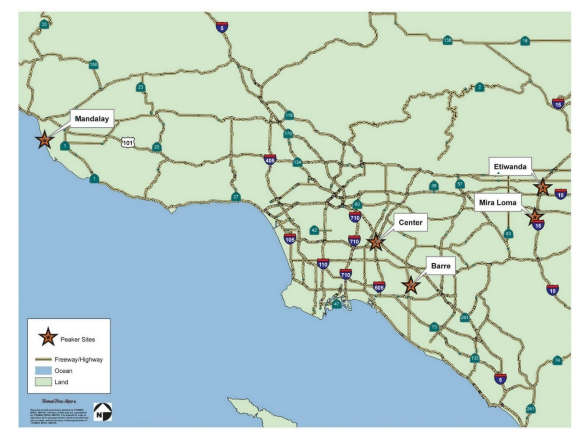
Figure 4-1: Relative Location of SCE's Five Generation Peaking Plants

On August 15, 2006, the California Public Utilities Commission (CPUC) issued an Assigned Commissioner's Ruling (ACR) addressing electric reliability needs in Southern California for the summer of 2007 and beyond. The August 15, 2006 ACR included a reference to the CAISO's August 9, 2006 letter to the CPUC that urged the CPUC to direct the state's investor-owned utilities to solicit a combination of quick-start generation and demand response opportunities that could be developed quickly (less than a year) to increase available electrical supply at the peak hours and to enhance grid reliability. To implement this directive, SCE took steps to install five separate peaking generator projects either within or near existing substations at five strategic locations around Southern California. Figure 4-1 shows the relative locations of the five facilities, all of which were constructed and are operating as mandated by the CPUC. Center is one of the five generation peaking facilities developed by SCE.