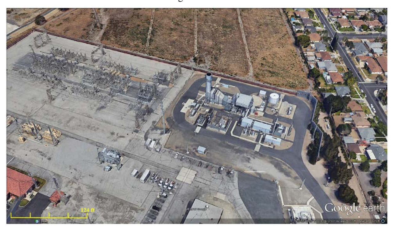
Center Facility View