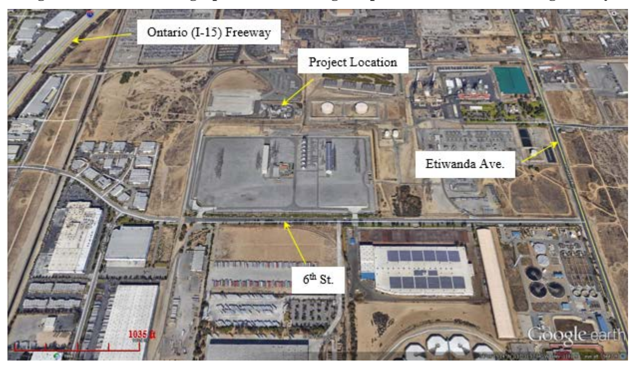
Figure 3-2: Aerial Photographs of the Existing Grapeland Generation Peaking Facility