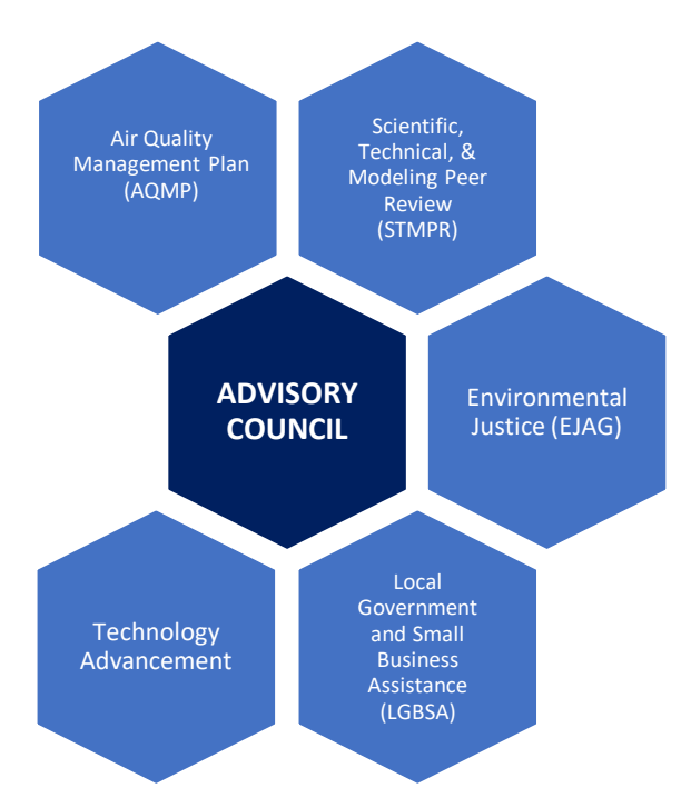
FIGURE 9-2 SOUTH COAST AQMD ADVISORY GROUPS FOR 2022 AQMP