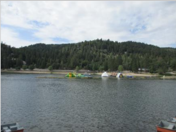
Looking South from the probe.