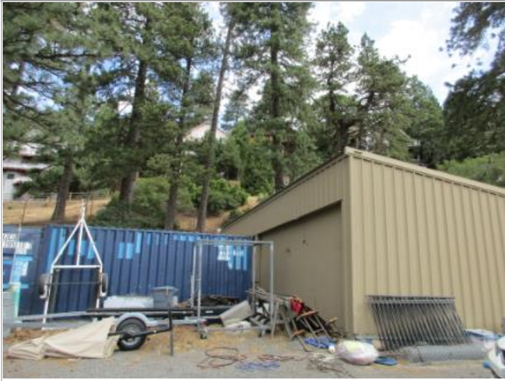
Looking North from the probe.