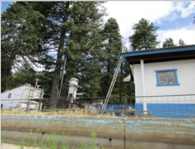
Looking at the probe from the South