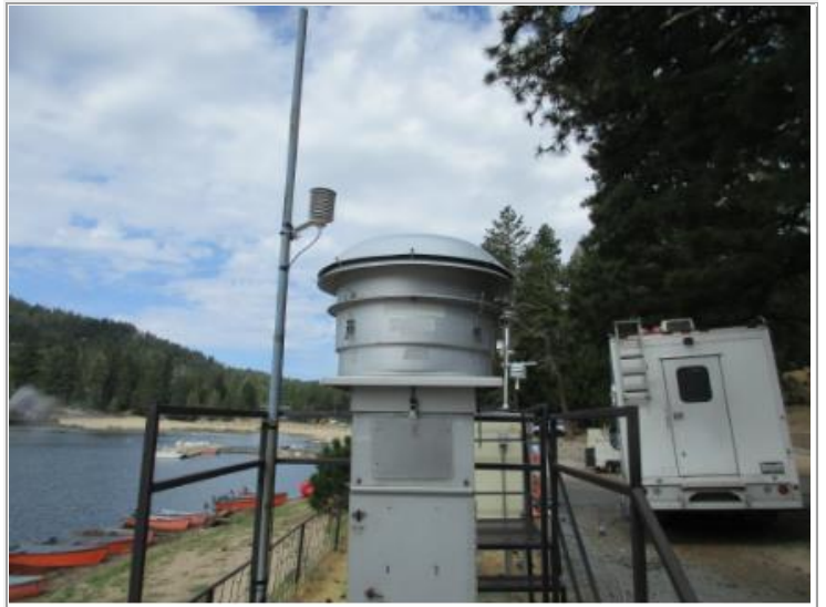
Looking West from the probe.