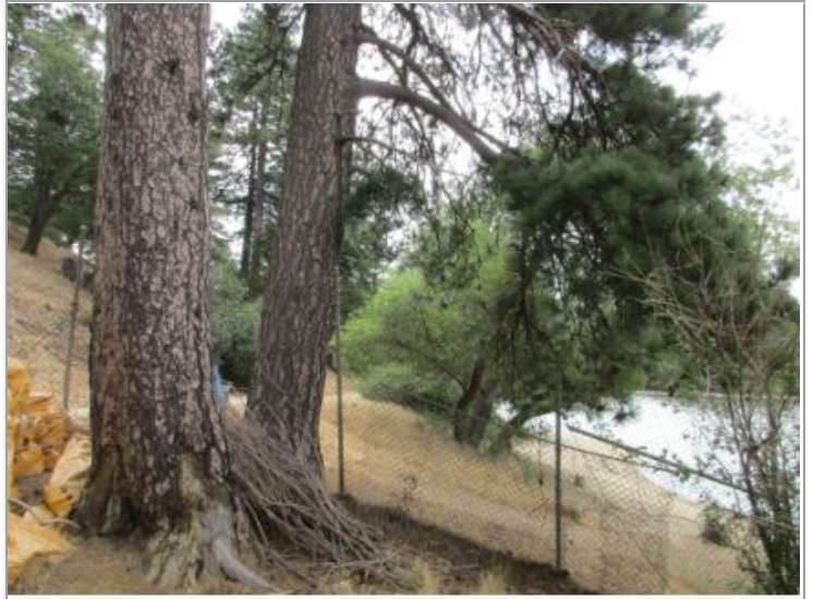
Looking East from the probe.