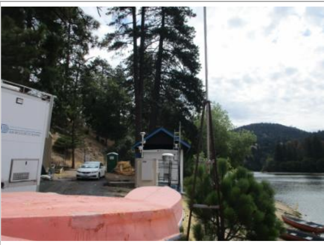
Looking at the probe from the West.