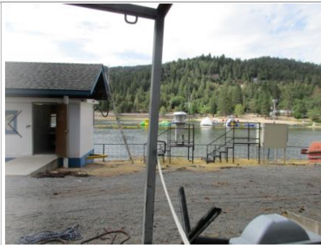
Looking at the probe from the North.