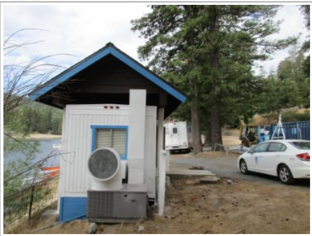
Looking at the probe from the East.