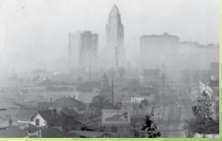
Downtown Los Angeles City Hall 1968