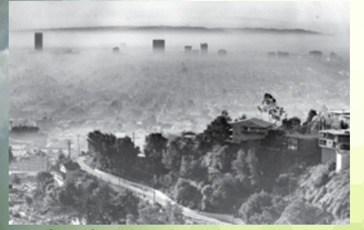
South Coast Basin Panoramic shot 1964

4/26: Loma Linda Maker Faire, Loma Linda