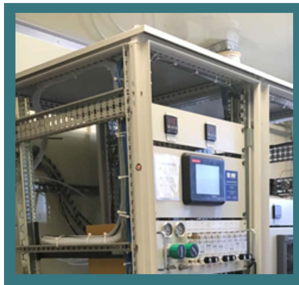
Continuous Emissions Monitoring Systems (CEMS)