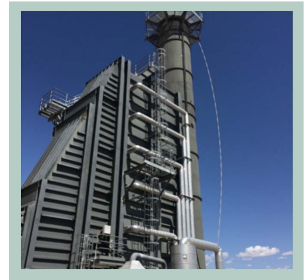
Startup, Shutdown, and Tuning