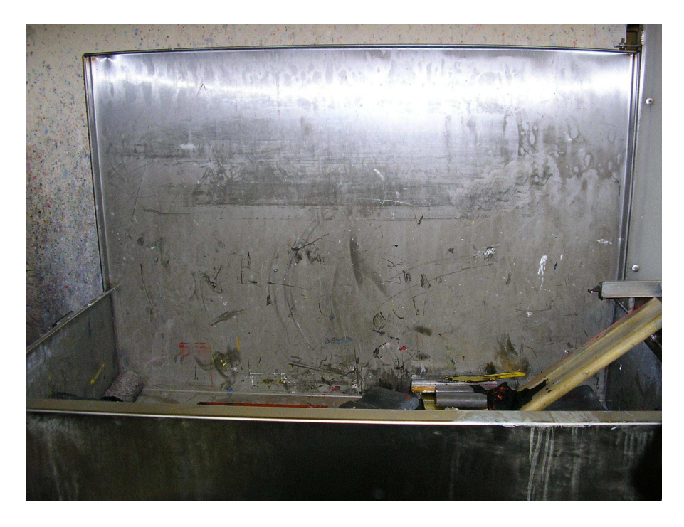
Figure 2-6. Parts Cleaner at LCA Promotions

The second cleaner tested at LCA in the parts cleaner was Soy Gold 2000, a vegetable based cleaner. An MSDS for this cleaner is shown in Appendix A. LCA tested the soy cleaner for several weeks in the parts cleaner. IRTA also provided the facility with the