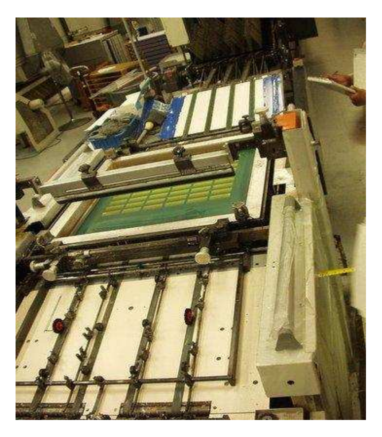
Figure 2-3. Automated Printing Press at Oberthur

Oberthur Card Systems is located in Rancho Dominguez, California. The company has several lithographic presses and two automated screen printing presses for printing on plastic used to make credit cards of all types. A picture of one of the screen printing presses is shown in Figure 2-3.