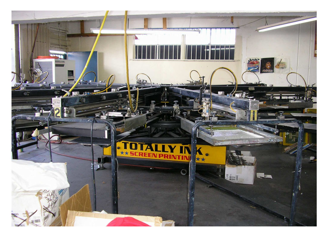
Figure 2-7. Automated Press at Totally Ink

Totally Ink is a small textile screen printer located in Northridge, California. The company prints on T-shirts, hats, jackets and magnetic signs. A picture of a press at Totally Ink is shown in Figure 2-7.