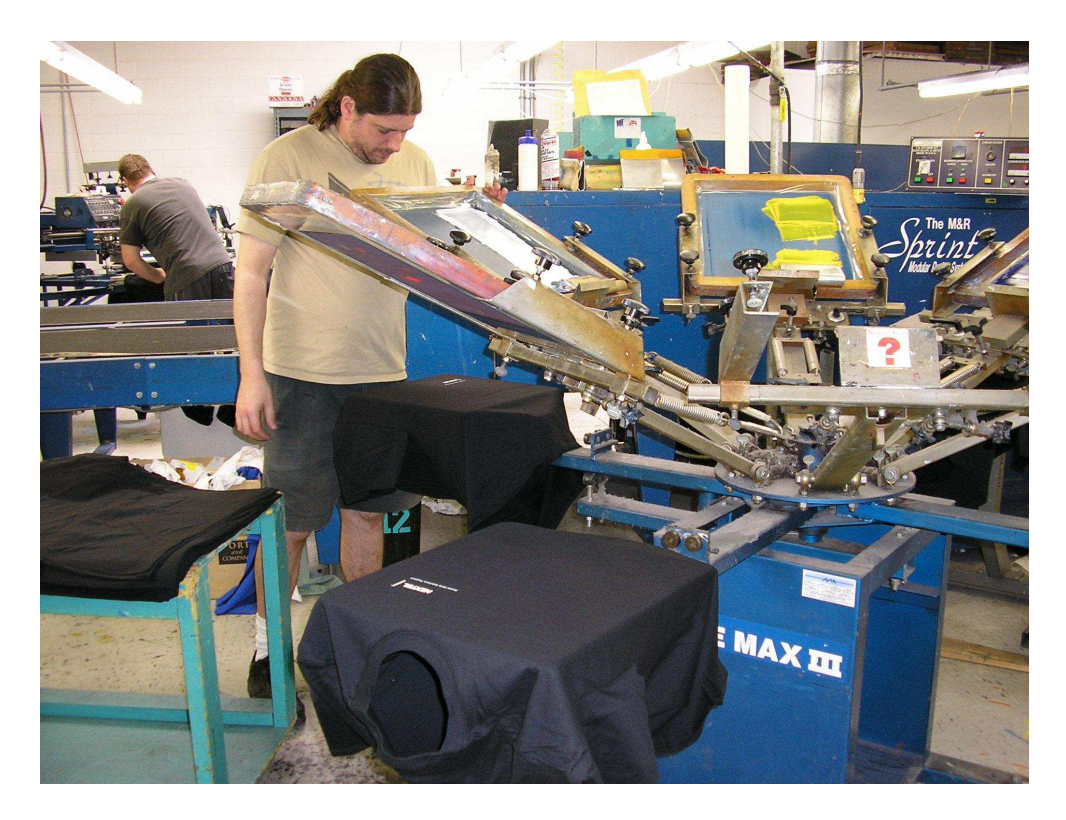
Figure 2-5. Automated Press at Quickdraw

IRTA conducted preliminary testing of several alternatives for cleaning after the printing process. The operator decided that a soy based cleaner called Soy Gold 2000 performed best. An MSDS for this cleaner is shown in Appendix A. IRTA provided Quickdraw