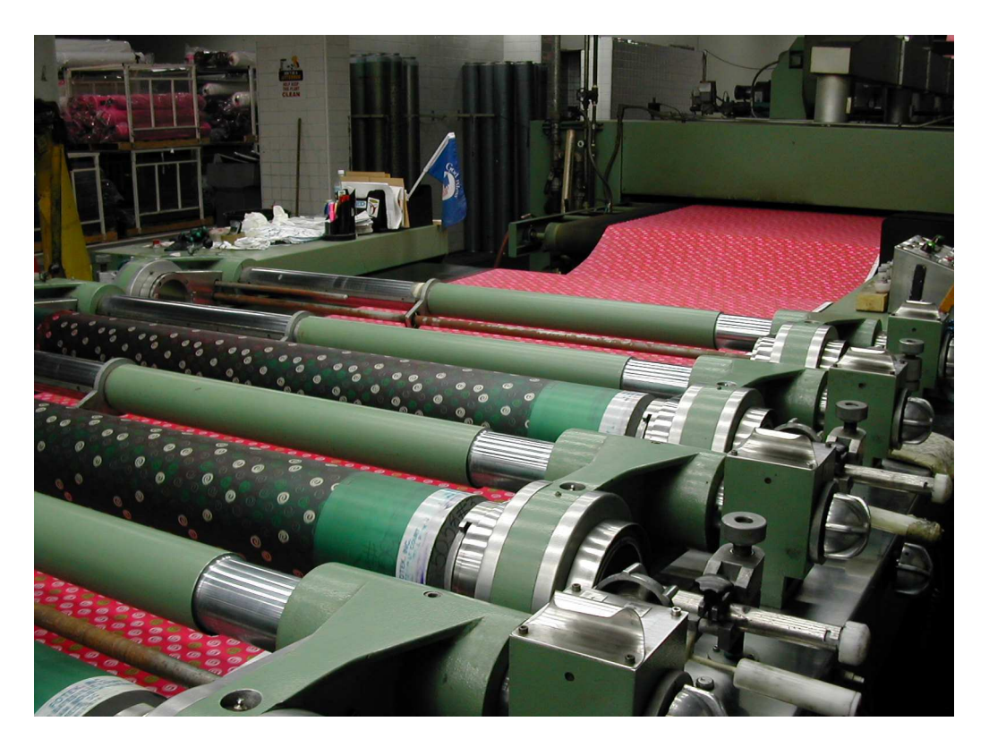
Figure 2-4. Printing Operation at Texollini

removed with water. The company cleaned these screens with a VOC solvent using a hand-held spray wand.