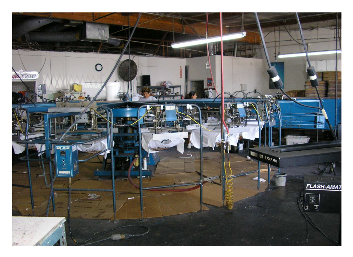
Figure 2-8. Automated Press at Powerhouse

IRTA began working with Powerhouse as part of a project sponsored by the South Coast Air Quality Management District. The purpose of the project is to identify, test and demonstrate low-VOC, low toxicity alternative screen cleaning formulations.